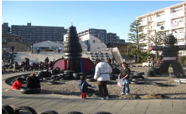
Figura 7. Familia en el parque Nishi-Rokugō, Tokio (Japón)