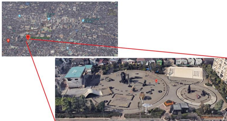
Figura 2. Ubicación del parque Nishi-Rokugō (Parque de los neumáticos)