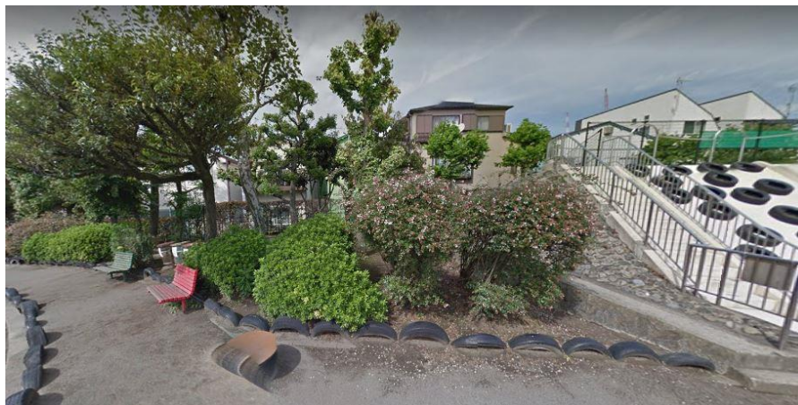
Figura 8. Vegetación diversa dentro del parque