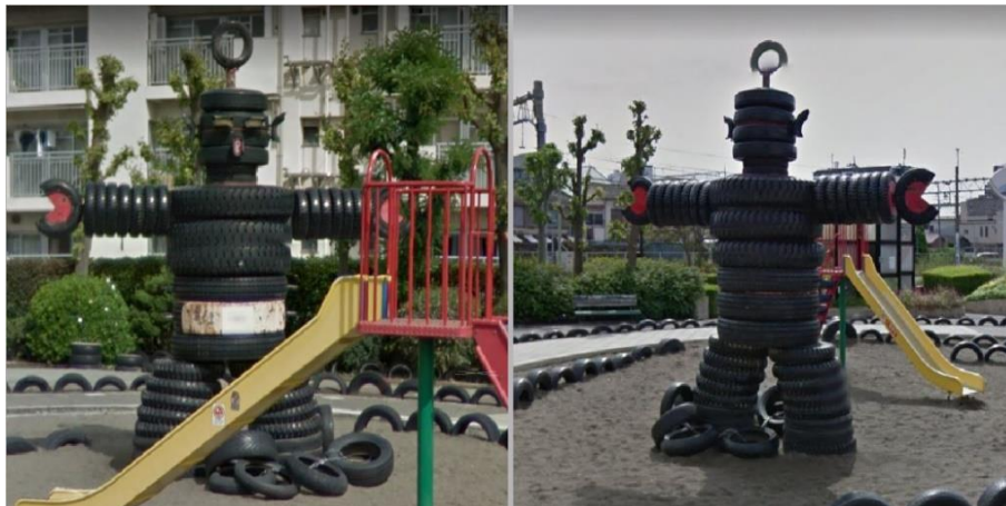
Figura 4. Escultura del robot con neumáticos reciclados