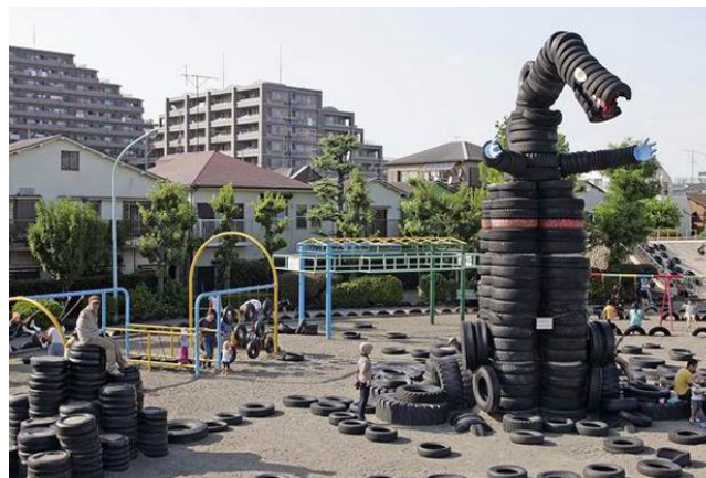
Figura 6. Escultura del enigmático personaje conocido como Godzilla