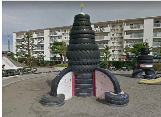
Figura 5. Nave espacial a base de neumáticos reciclados